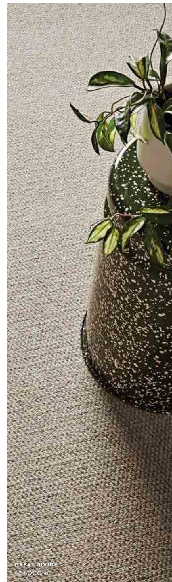
GREAT DIVIDE 43 BOGONG

Though the best available techniques are used during manufacture to minimise pattern distortion, the extensible nature of textile products means that some distortion due to shrinkage or stretch during and after manufacture is unavoidable. Accordingly, repeating patterns may not precisely match along the carpet length or width or from one production run to another. Installation methods and site and storage conditions can also contribute to instability in the pattern, such that perfect pattern match cannot be guaranteed. Installation of patterned carpet will require more time, effort and skill which should be considered in the original labour quotation. A competent carpet layer should be able to obtain a close pattern match in most circumstances. However some irregularities may still be visible in the horizontal, vertical and diagonal pattern or texture, especially when viewing across multiple width installations. If concerned, please discuss further with your retailer and/or carpet layer. Further, all carpets are subject to some degree of bowing and/or skewing. Bowing of up to 40mm over any single width of carpet is generally acceptable. Full details of the tolerances of Feltex carpets are set out in the Feltex Carpets Installation Recommendations (available at www.feltex.com or call 1300 130 239).