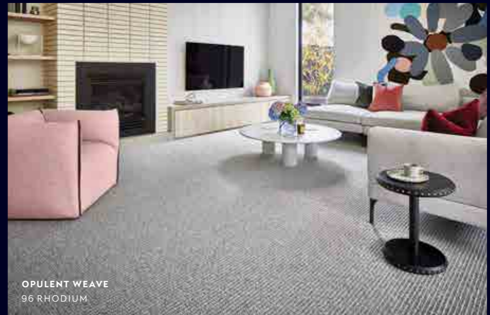
OPULENT WEAVE 96 RHODIUM