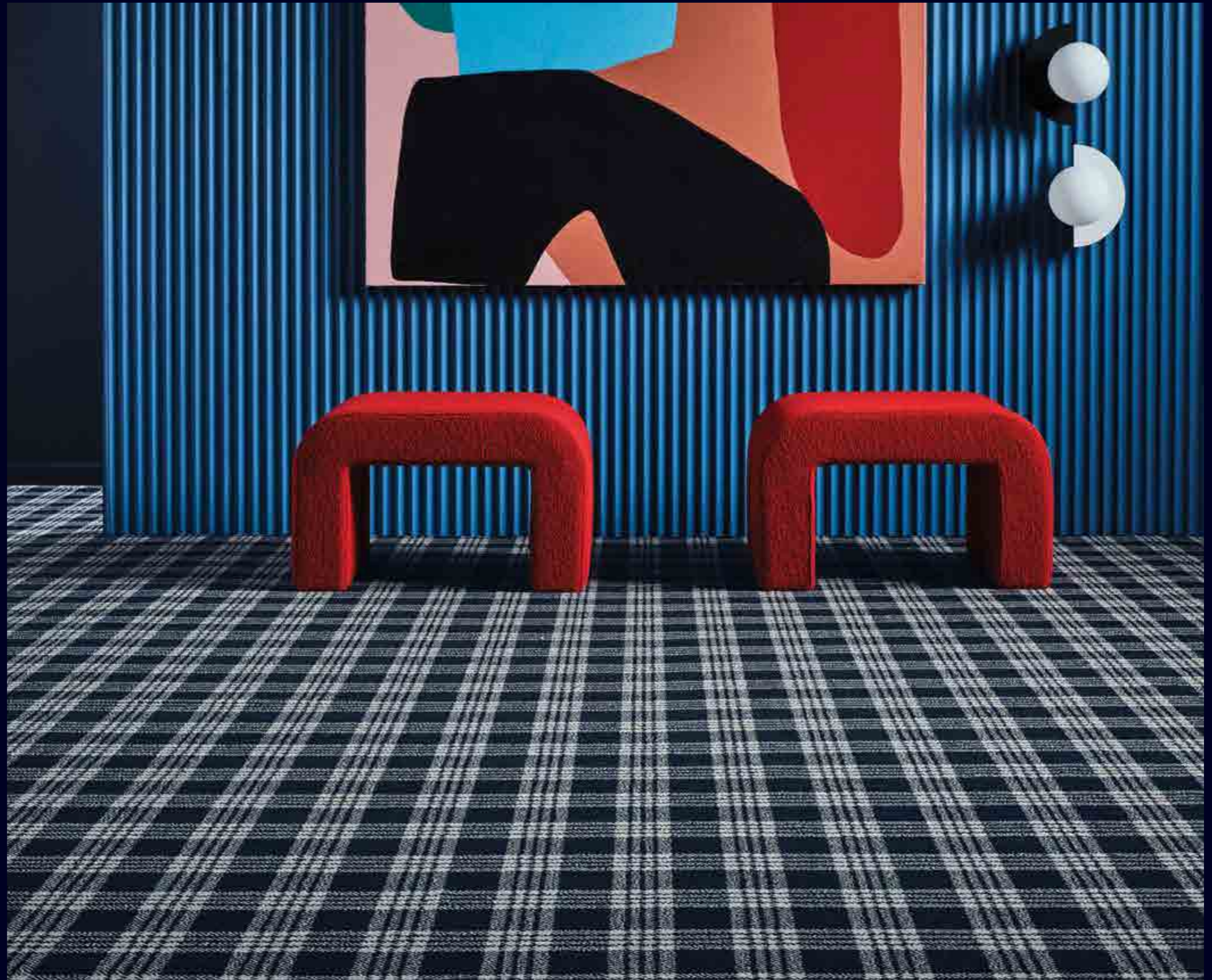
ARTISAN 34 TARTAN BELLS