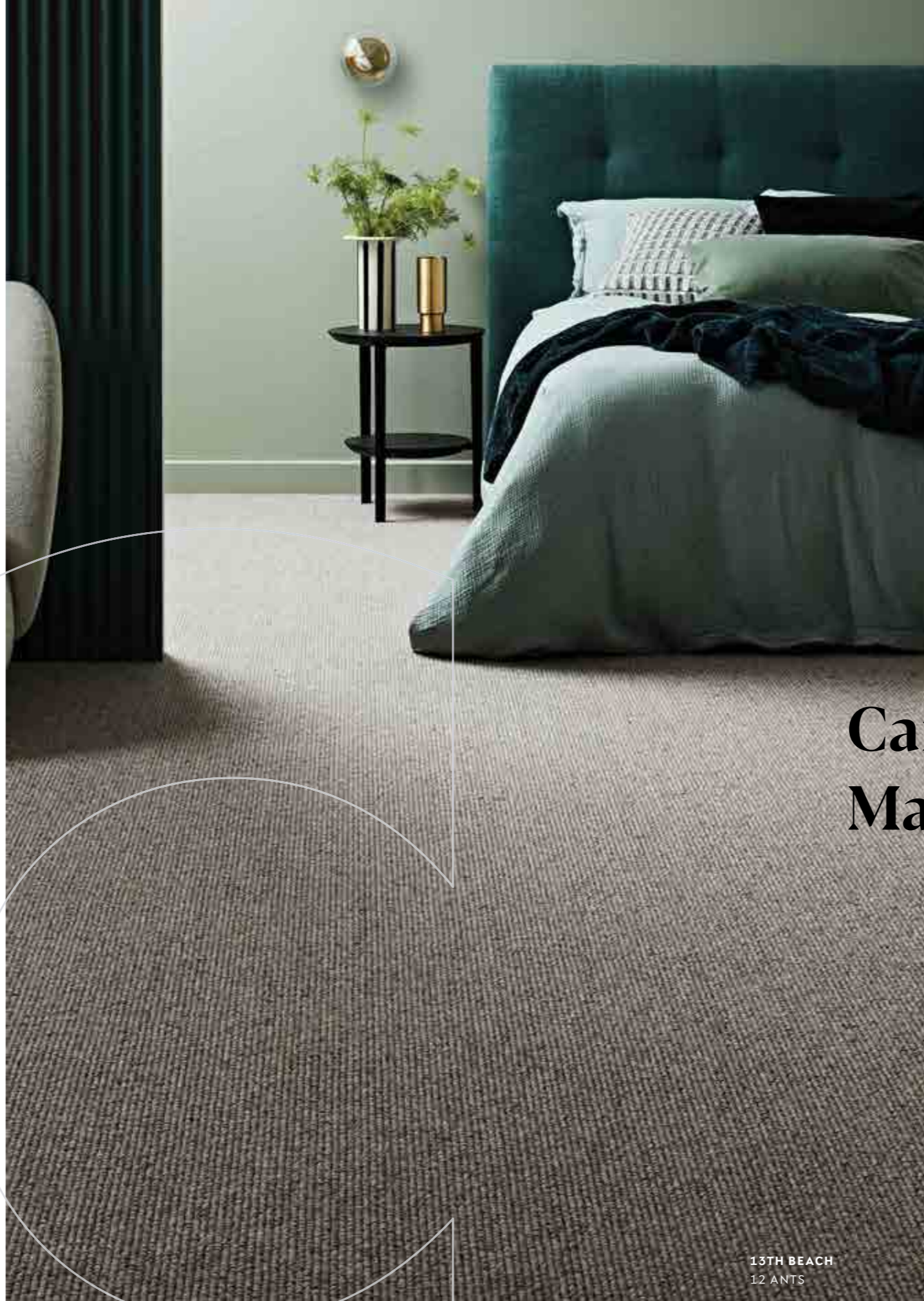
13TH BEACH 12 ANTS