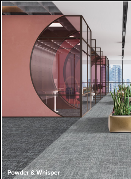
Powder & Whisper