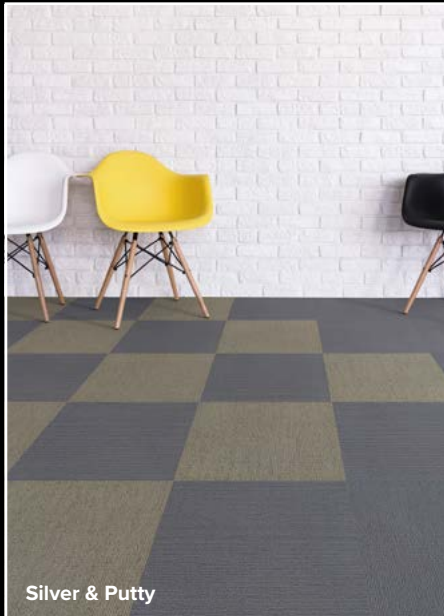
Silver & Putty