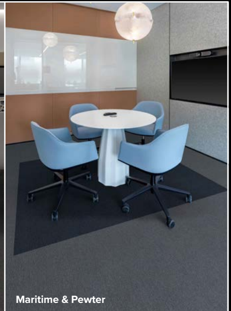
Maritime & Pewter